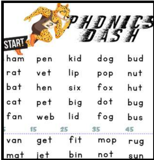
A, E, I, O, U Order